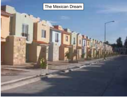
The Mexican Dream

the ring road. The houses sell for under $40,000 and are small by high-income standards. They are approximately 650 square feet, or one-third the present average for new houses in the United States. But they are very nicely done and would be attractive places to live, though the high-wall enclosed backyard, hardly larger than a small bedroom, would be somewhat confining.