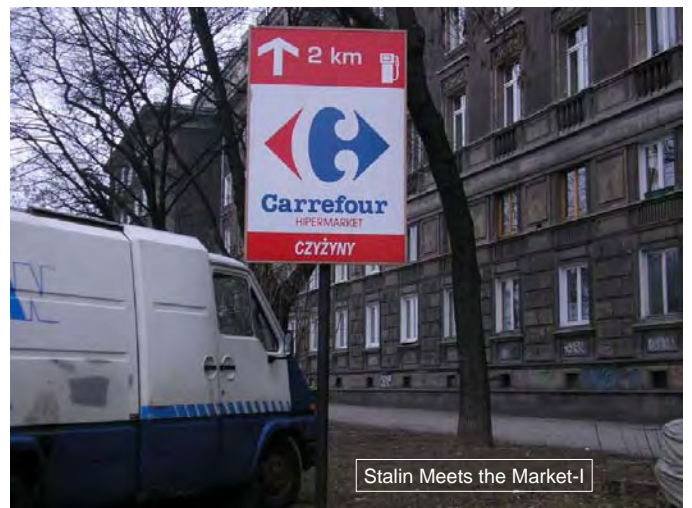
Stalin Meets the Market-I