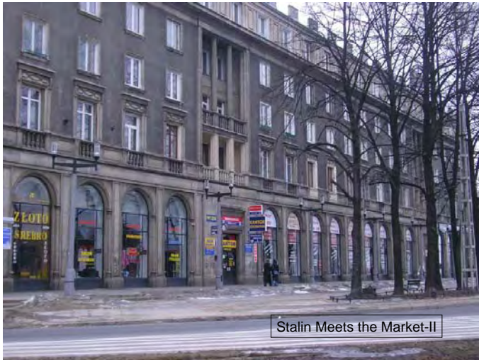
Stalin Meets the Market-II