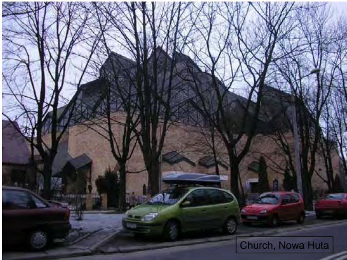
Church, Nowa Huta