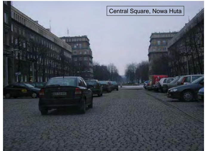
Central Square, Nowa Huta