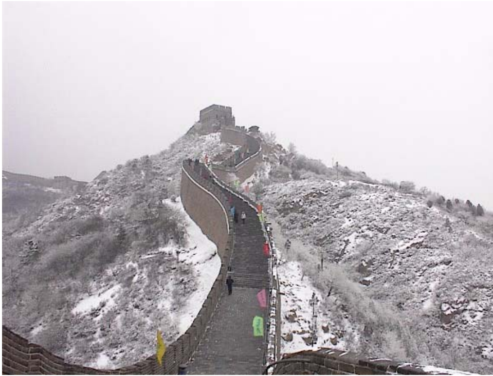
Great Wall, East Side of Motorway