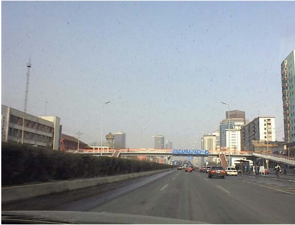
2nd Ring Road