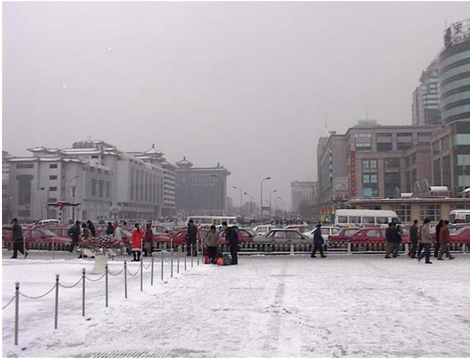
Taxis in Front of Beijing Station