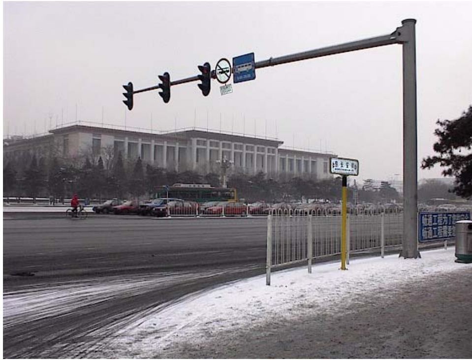
Government Building, Tiananmen Square