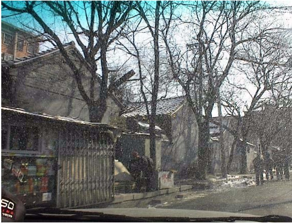
Hutongs --- Central East Beijing