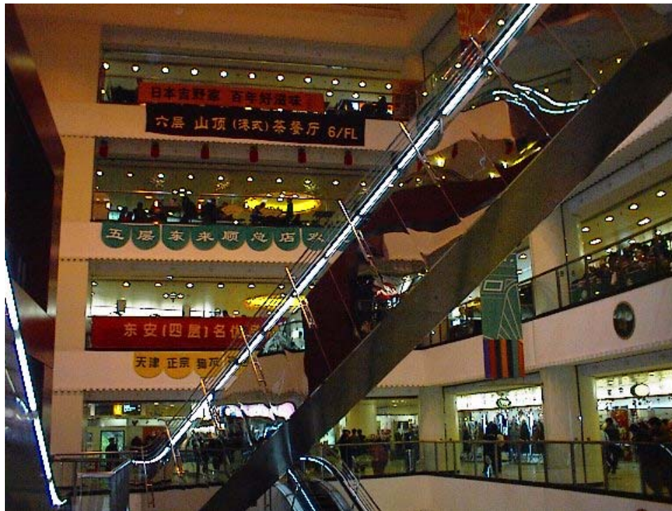
Sun Dong An Plaza