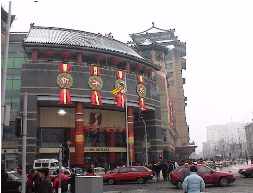
Sun Dong An Plaza (Shopping)