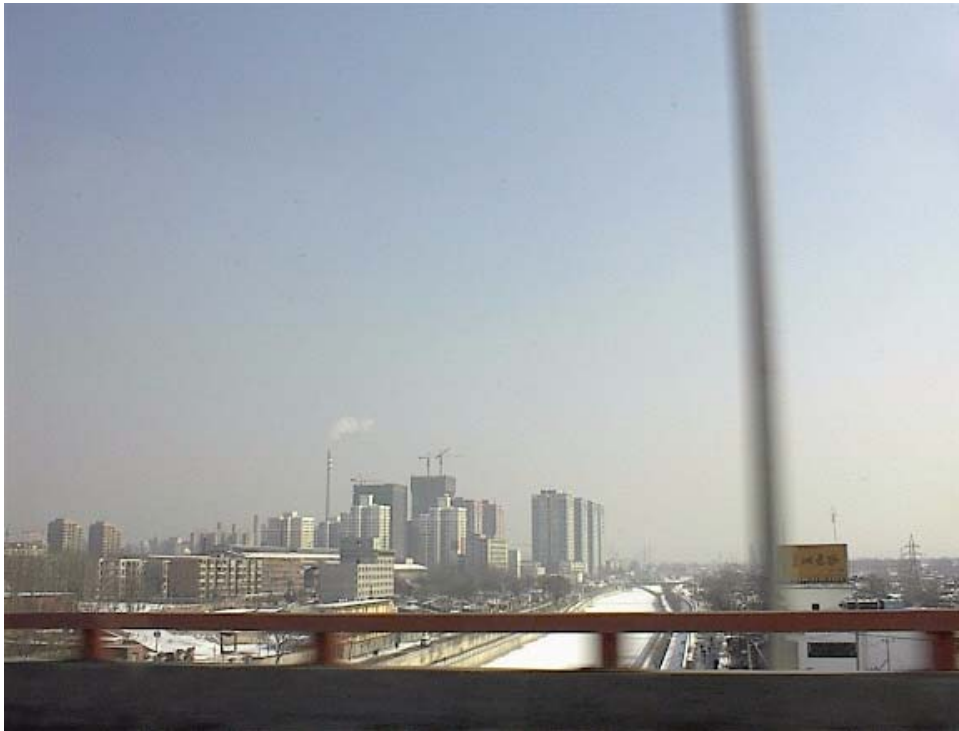
View from 2 nd Ring Road