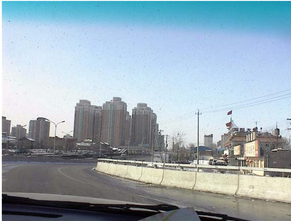
4 th Ring Road