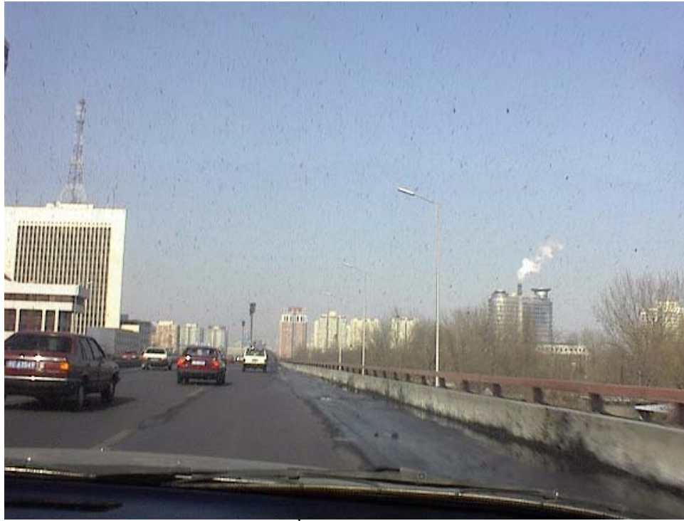
4 th Ring Road