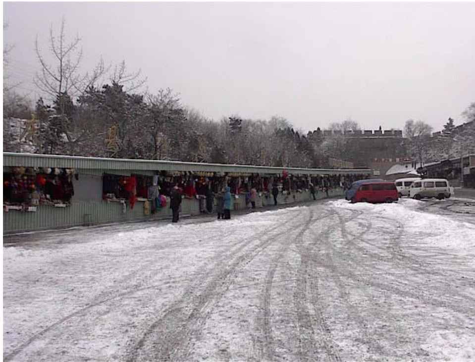
Entrepreneurship at the Great Wall of China

One comes away from Beijing, and other east coast cities in China, with a feeling that these places have achieved middle-income world status and will soon be high-income world places. Western and central China, I am told, is much different. But in Beijing you see an urban area well on its way to the prosperity that would be the product of human endeavor virtually everywhere if governments would simply let it happen. One might have all manner of criticism of some Chinese government policies. But the economic progress is impressive and cannot be denied.