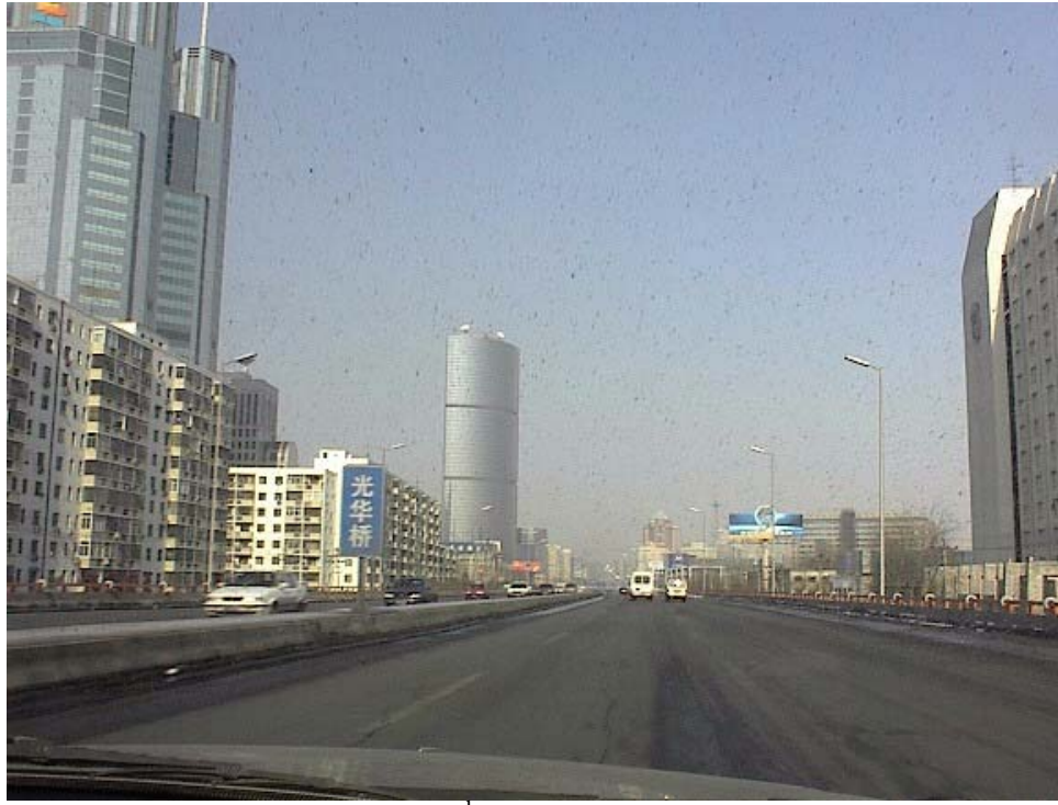
3 rd Ring Road